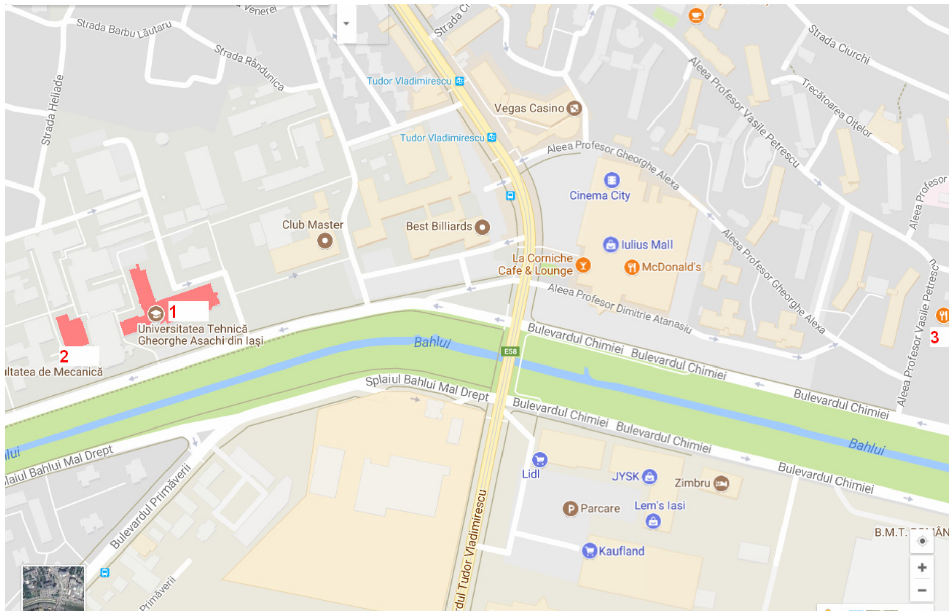
1 – University Conference Hall; 2 – IMMR Department; 3 – University Restaurant